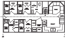
BELOW DECK PLAN